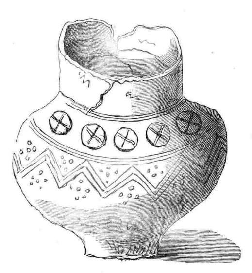
VESSEL FOUND AT BURGH CASTLE. Never previously engraved. One-fourth original size. Drawn by H. Watling.